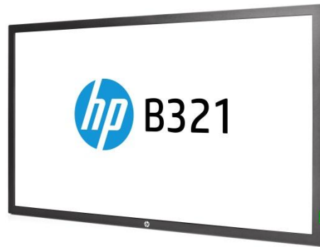
HP B321 31.5-inch LED Digital Signage Display

Bring an essential digital signage display into your organization at an affordable price point with the HP B321 31.5-inch LED Digital Signage Display, designed for use in conference rooms, reception areas, hallways, and anywhere you want to publicly distribute content during normal business hours.